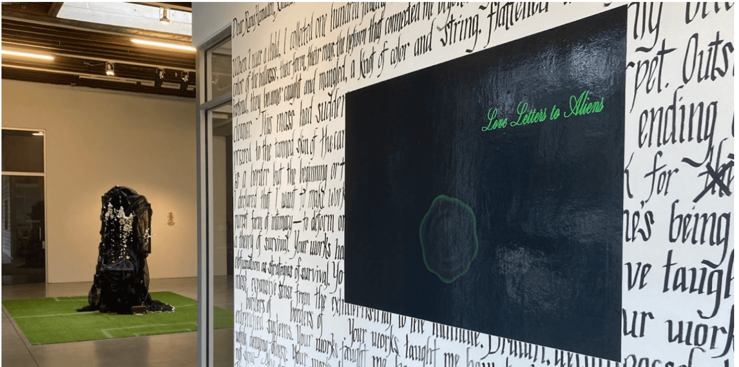
Love Letters to Aliens, Install View, Entrance