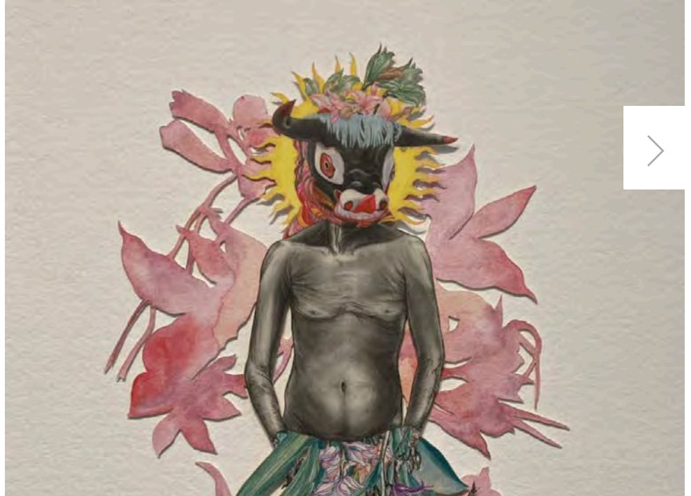
Oswaldo Ramirez Castillo Untitled , 2025, mixed media drawing, 12.25 x 16 inches